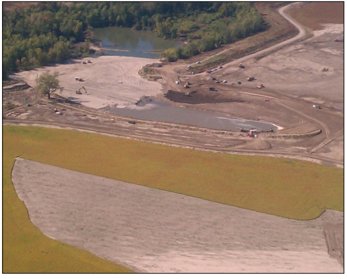
The center crevasse scour hole as seen from the air Oct. 25 during dredging. The area to the right of the levee was filled in after this photo was taken.

The follow-on project to Operation "Make Safe", called Operation "Restore", will reconstruct the Floodway system to the pre-operational level of protection. The construction schedule is contingent on the availability of funding.